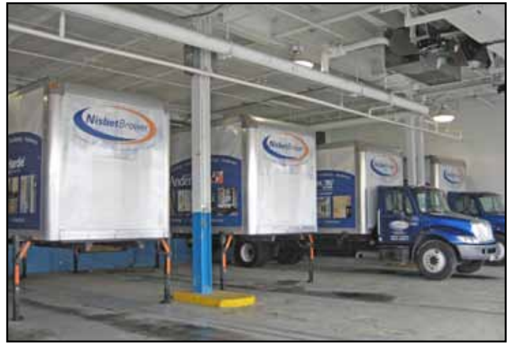
Swap Empty Bodies for Loaded Bodies in Minutes