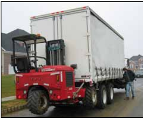
Equipped with Moffett