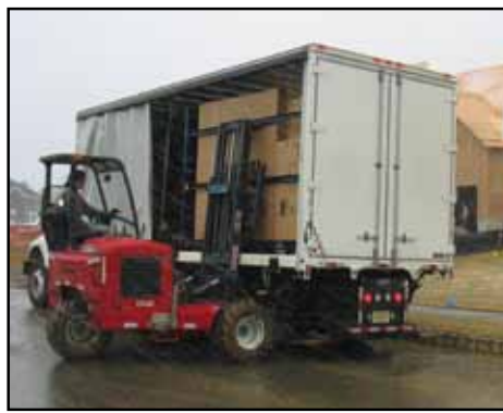
Curtain Body for Side Loading