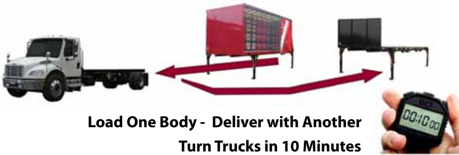
Load One Body - Deliver with Another Turn Trucks in 10 Minutes