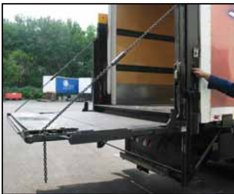
Rail and Tuck-Under Gates