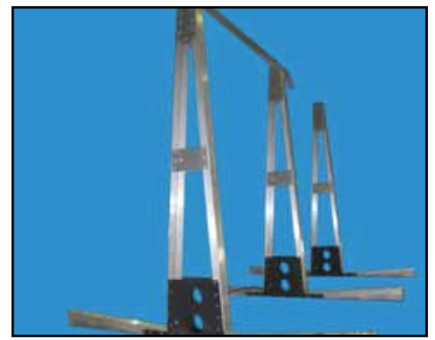
Material Transport Racks Fabricated for Bodies