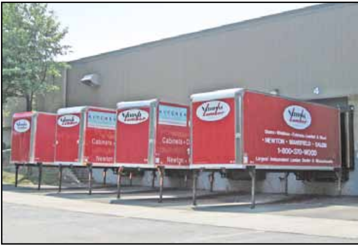
Load Free-Standing Bodies While Truck is Out Delivering