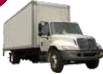
Two Fixed-Body Straight-Trucks