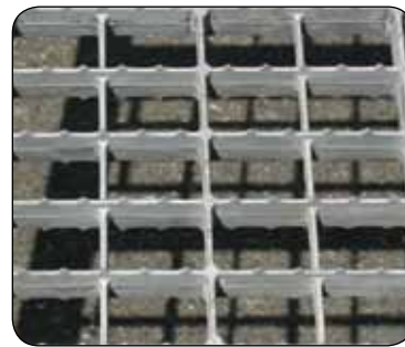
Open castings prevent build-up of slippery materials