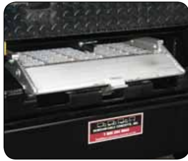
Ramp stores in chassis lift for convenience