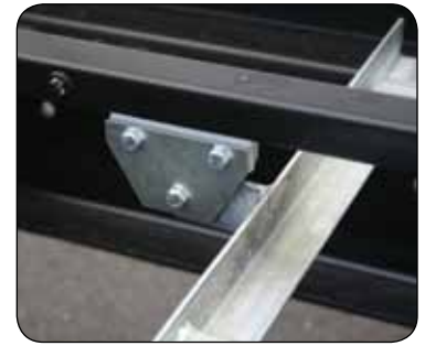
Strong monorail track with heavy duty support brackets