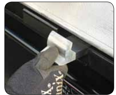
Spring loaded latch holds ramp securely in place

Also features bolted modular construction (no welds) for easy field repairs and a reversible double-sided walk surface that virtually doubles product life