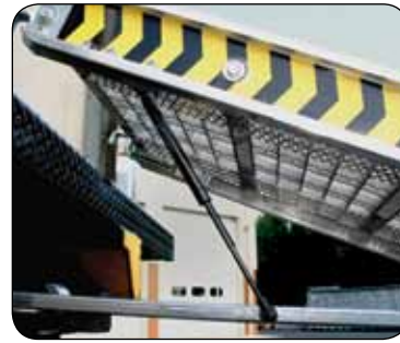
Standard lift assist reduces driver fatigue