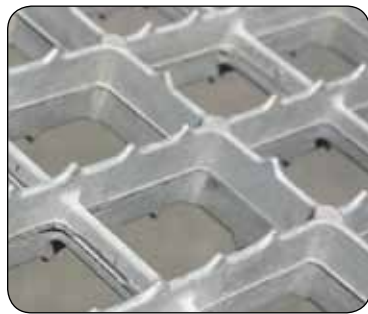
Aggressive traction surface enhances safety