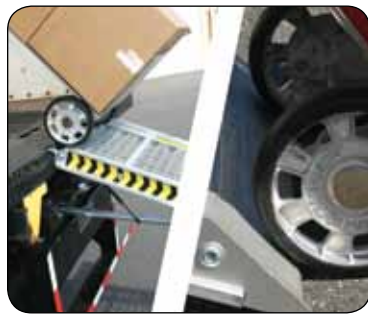
Smooth transitions on and off ramp