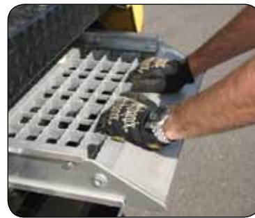
Integrated handles make set-up quick and easy