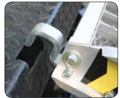
Easy to attach to truck body in correct position